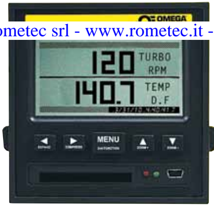
reading mode, shown smaller than actual size.