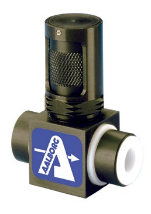
PTFE Metering Valve

MVT™ Metering valves are constructed of PTFE and PEEK materials.