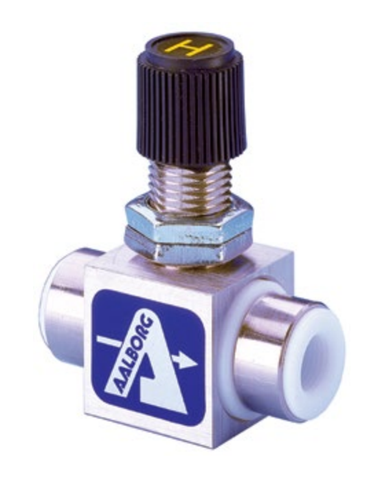
PTFE Needle valve with Stainless Shell and FNPT Fittings

Note: Based on 10psig (69 kPa) inlet pressure and atmospheric exhaust.